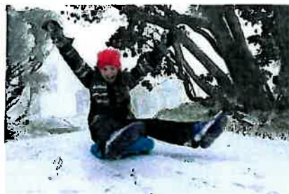
PHOTO: Tobogganing increases the "risk of collision", the resort says.