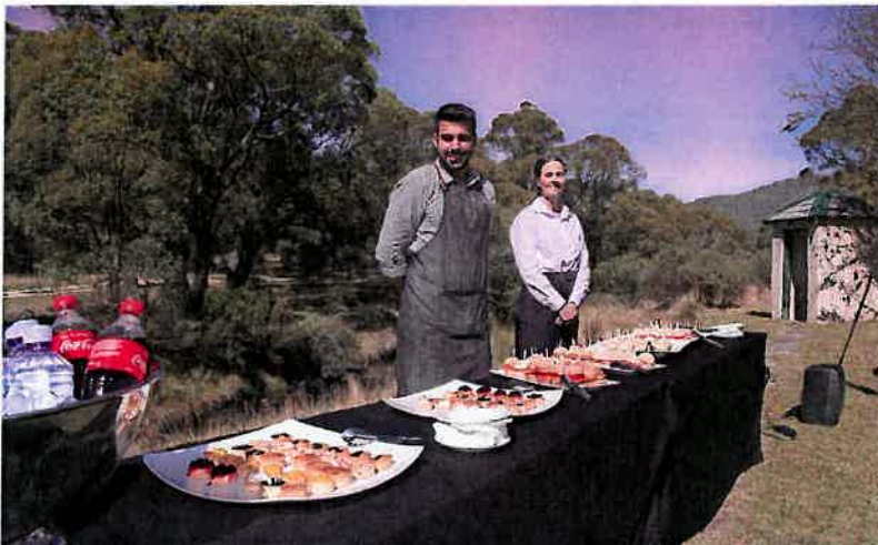
Lake Crackenback Resort staff supply lunch to the crowd.