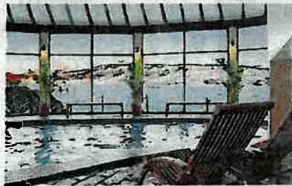
From top: The Man From Snowy River Hotel; The Marritz Hotel's heated swimming pool.