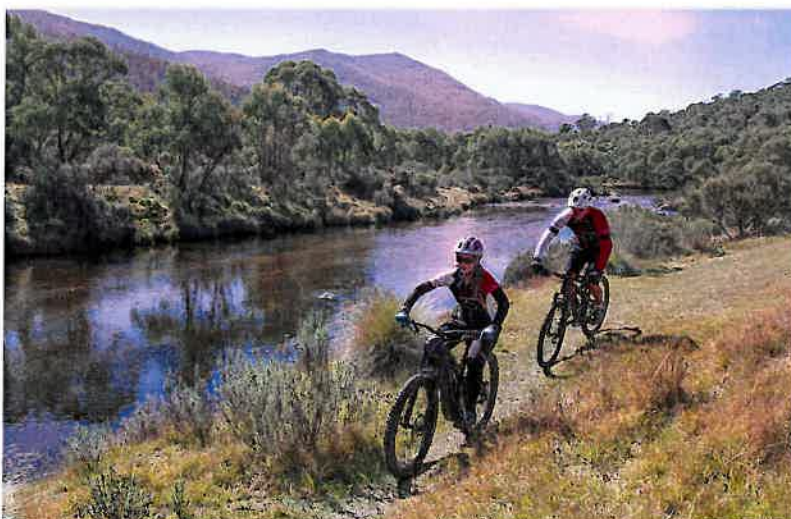
It was a perfect day for a mountain bike ride along the Thredbo River, especially after a $10 million announcement to