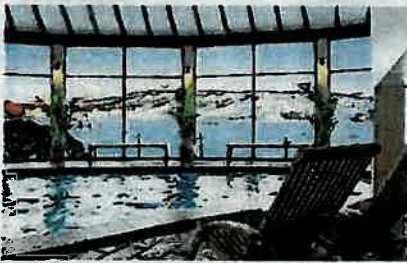
From top: The Man From Snowy River Hotel; The Marritz Hotel's heated swimming pool.