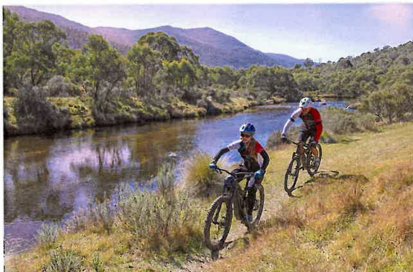
It was a perfect day for a mountain bike ride along the Thredbo River, especially after a $10 million announcement to