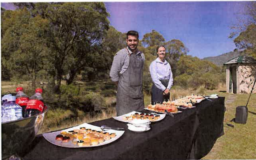
Lake Crackenback Resort staff supply lunch to the crowd.