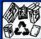
Paper & cardboard