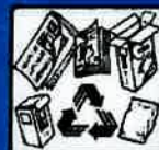
Paper & cardboard